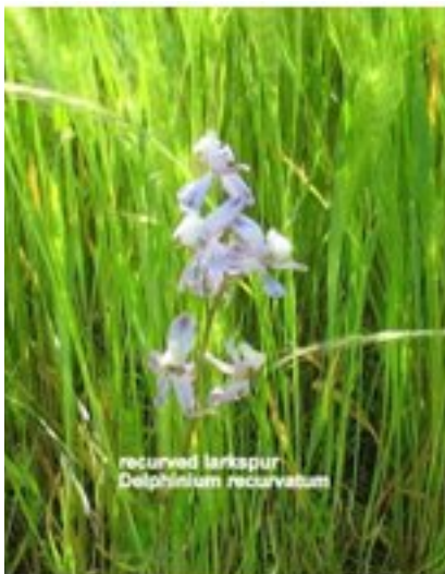
recurved larkspur Delphinium recurvatum