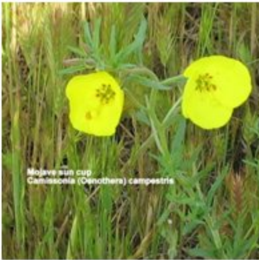
Mojave sun cup Camissonia (Oenothera) campestris