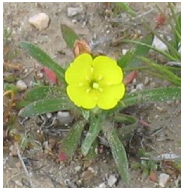
Hill Sun Cup Camissonia gracilliflora