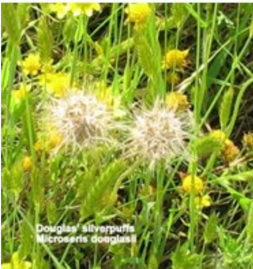
Douglas' silverpuffs Microseris douglasii