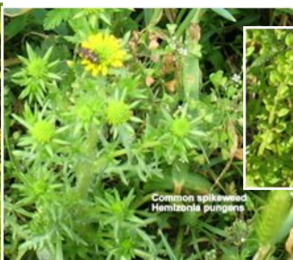
Common spikeweed Hemizonia pungens