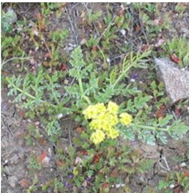
Wild Parsley Lomatium utriculatum

Here are a few of the pictures taken by Don.