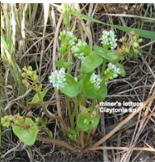
miner's lettuce Claytonia sp.