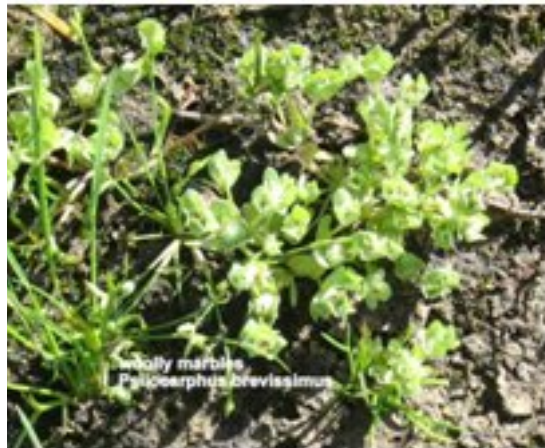
sandy marble Polioosperma brevissimum