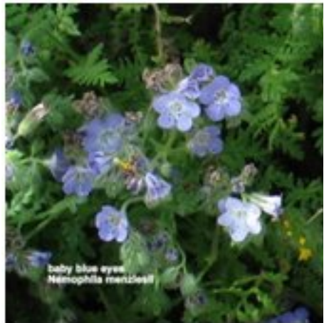
baby blue eyes Memphila menziesii