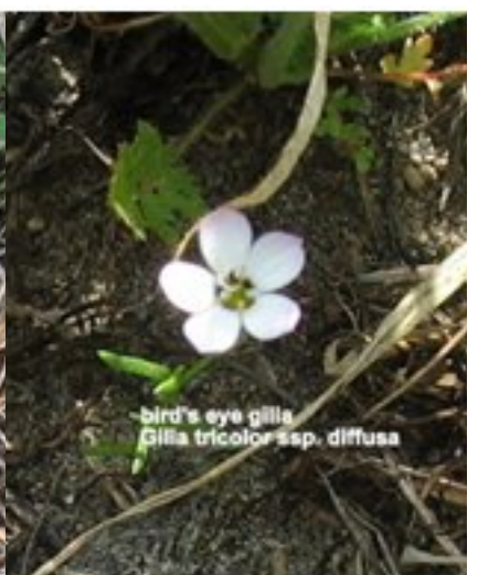
bird's eye gilia Gilia tricolor ssp. diffusa