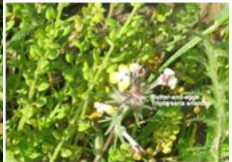
Yellow-eyed penguin Trifolium aureum